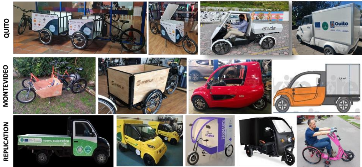
Figure 2: LEVs funded by SOLUTIONSplus in Latin America