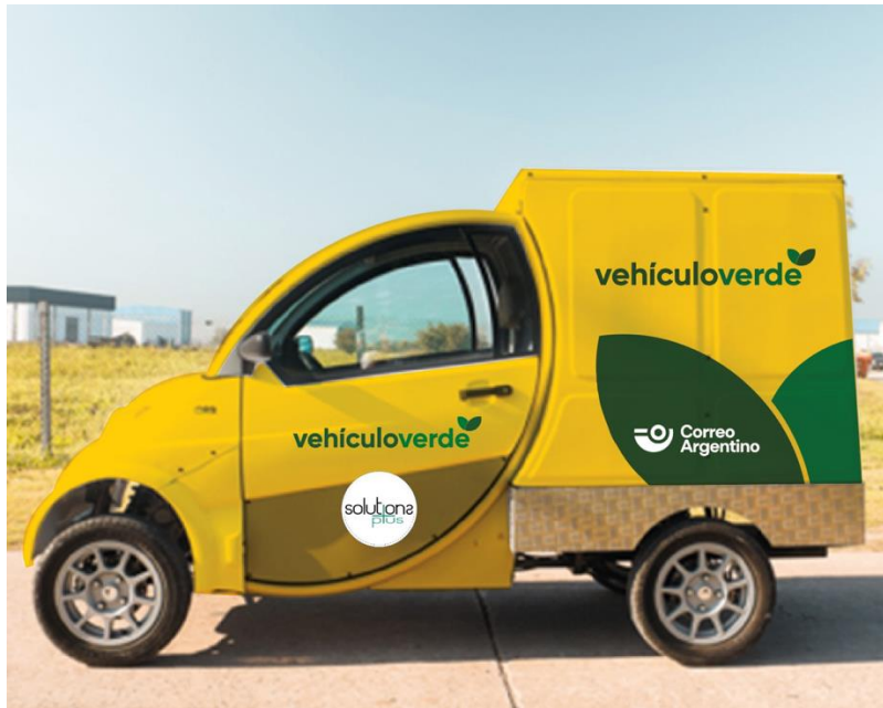
Figure 5: Pilot vehicle for the SOLUTIONSplus Replication Activity in Buenos Aires (Correo Argentino, 2023)

The Pilot's objective was to evaluate the performance of LEVs for the delivery of parcels for Correo Argentino in selected areas, replacing internal combustion (Diesel) vans. Through the analysis of indicators and KPIs defined by the SOLUTIONSplus team (operational, environmental, financial and user perception indicators), it was possible to understand the performance of these vehicles in real operation conditions. After completing the monitoring phase, the possibility of scaling up this type of operations to other Hubs and distribution centers of the company was assessed. A total of 2t CO2 emissions were avoided during the pilot. A comparison of the operational indicators of the LEV used vs the ICE van used previously is presented in Table 1.