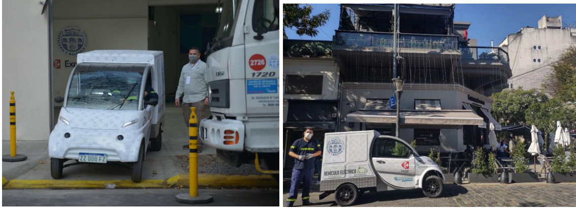
Figure 3: Express Logística EV operations on Microhub (left) and commercial street (right) in Buenos Aires

Other institutions are also advancing in the same direction. Correo Argentino is the official courier service of the Argentine Republic, with operations throughout the country. The sustainability area of Correo Argentino is working on a Plan to modernize the parcel distribution Hubs in the Buenos Aires metropolitan area, incorporating digitalization into the process and replacing polluting vehicles with low-CO 2 -emission alternatives. This includes the implementation of a Pilot Hub and then continuing with the modernization of the 7 Hubs in the metropolitan area.