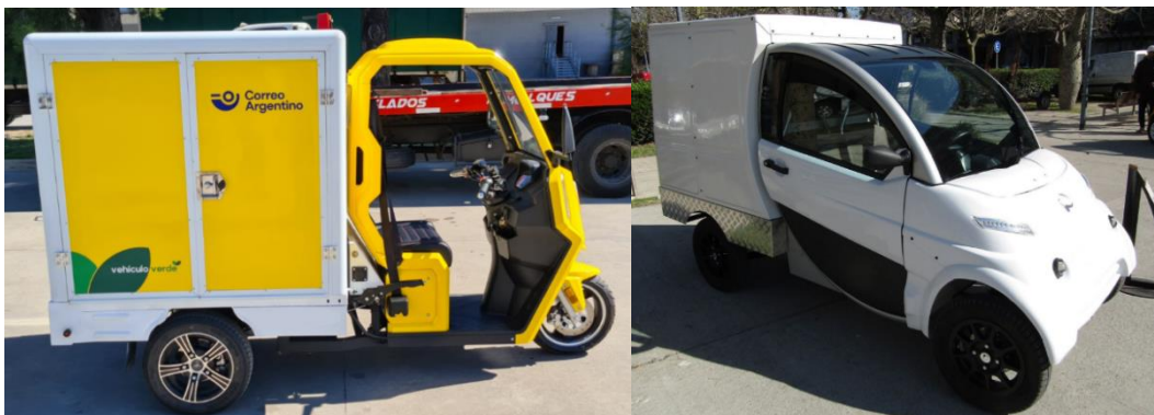
Figure 4: Pilot vehicle of Correo Argentino (left) and SERO electric vehicle for urban logistics (right).

SERO Electric is the Argentine company that in 2010 started a project to develop “Microcars”, inspired by vehicles that circulate in Europe. The objective of the company is to locally manufacture this kind of vehicles in Argentina (also developing local suppliers) and scale up to different markets. Today the company offers 5 different models approved for passenger and cargo transportation.