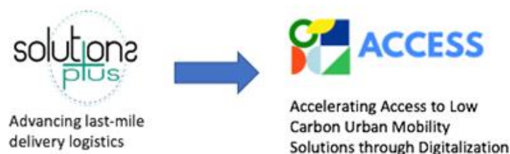
Figure 6: SOL+ and ACCESS project

The scale up project will utilize all the findings, structure, lessons learnt, stakeholders already developed within the SOLUTIONSplus project to accelerate the transition to EVs for urban logistics and also adding the digitalization layer with the ACCESS project