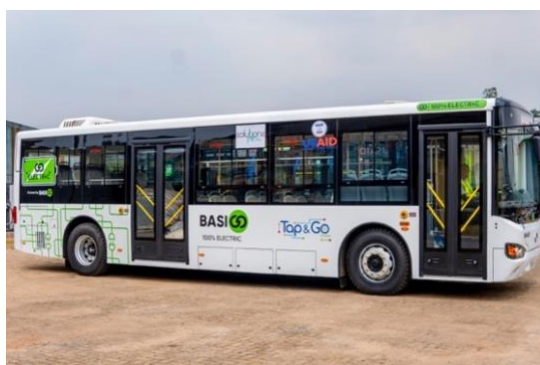
Figure 4: Electric buses piloted in Kigali

Results from the project informed the development strategy and financing model for scaling electric buses, resulting in a Kigali E-Bus Master Plan initiated by the City of Kigali and ITDP in the second half of 2023. This study explores factors influencing the operations of electric buses, such as daily range, topography, and demand along each route. It incorporates a model to determine the routes which can go electric in the short and long terms, the energy required to power the electric buses, and the charging infrastructure technology to be adopted.