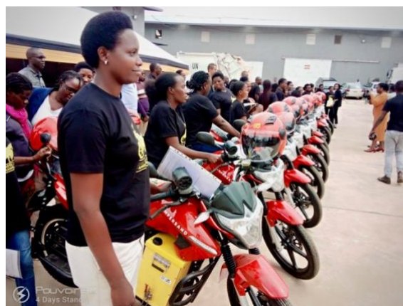
Figure 11. Handing over E-Motorcycles to trained women in Kigali