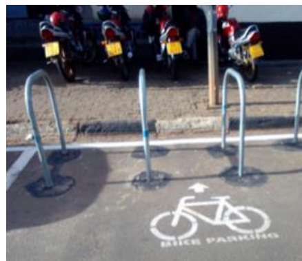
Figure 3. Bikeshare scheme and bike rack deployment in Kigali