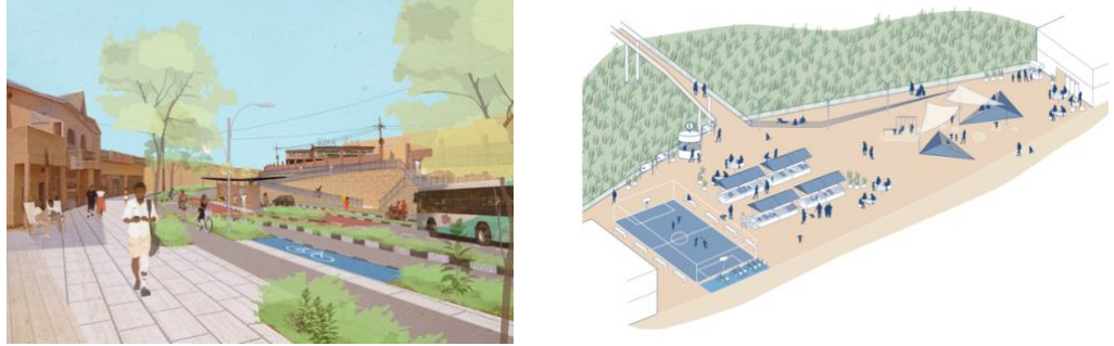
Figure 6: Design recommendations to improve non-motorised transport infrastructure, intermodality and charging infrastructure in Kigali (TUB, University of Rwanda)

Awareness raising Partners of the SOLUTIONSplus Kigali Living Lab were informed through numerous tools and guides on the various forms of electric mobility supported in Kigali. Knowledge products on vehicle technologies, charging strategies, and relevant policies for in East Africa were incorporated into the SOLUTIONSplus online toolbox, (for instance, 'Electrifying motorcycle-taxi fleets - Illustrative examples from East Africa ', 'Electric Vehicle Charging Infrastructure - Kigali Demonstration Action', 'Electric Bicycles in Rwanda: Fiscal and Regulatory Framework,' and 'Improving Gender Equality Through Electric Mobility: Learnings from the SOLUTIONSplus pilot in Kigali, Rwanda.').