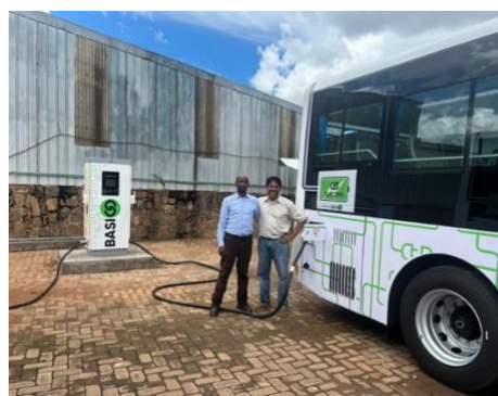
Figure 5: Electric bus charging station